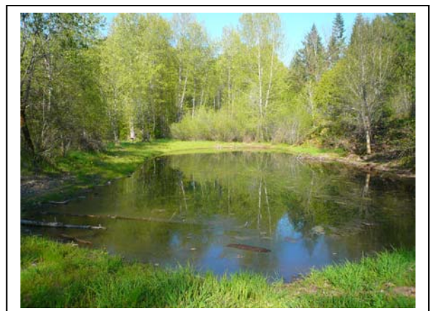
Post-Implementation: Water levels, aquatic vegetation and riparian grasses and trees healthy. May 2008