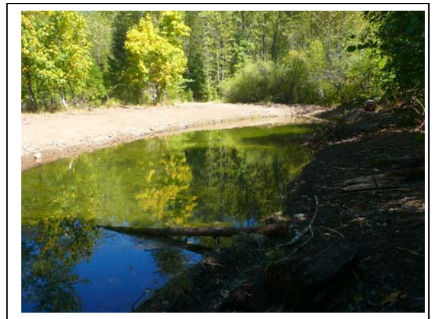
Implementation: 500 square by 1.8 meter pond with sloped banks. August 2007.