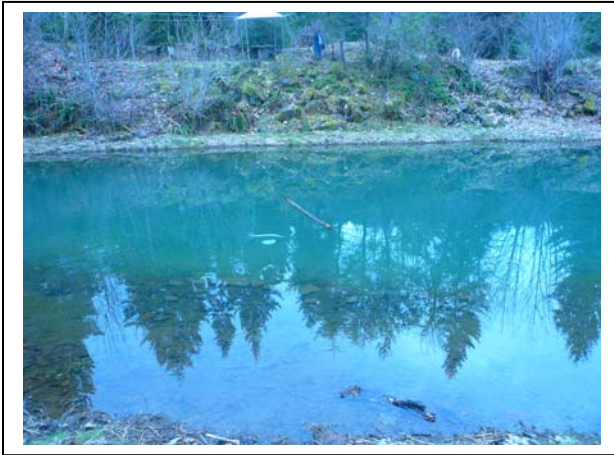
Post-Implementation: Water levels are stable. March 2008