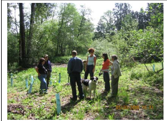
Pre-Implementation: Public receives tour of proposed project site. June 2007