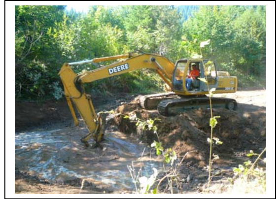
Implementation: Excavator removes earth to create 1.8 meter depth pond for Oregon chub. August 2007