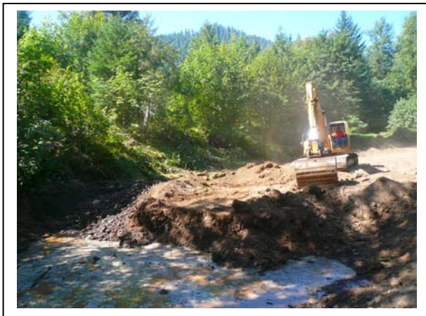
Implementation: 500 square meter pond excavated to create off-channel habitat for Oregon chub.