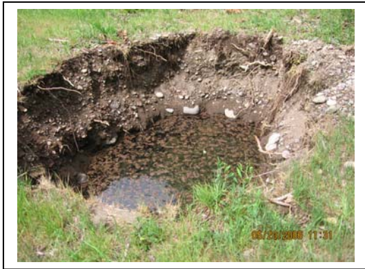
Pre-Implementation: East hole; monitoring of water table levels indicates decrease of water elevation over time. May 2006

OWEB Project #207-074 Year One Monitoring Report