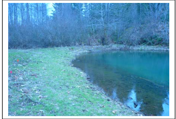
Post-Implementation: Elymus Glaucus established on slopes, providing bank stabilization. March 2008.