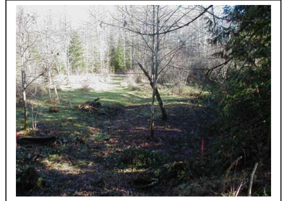
Pre-implementation: Based on monitoring results, project redesigned for excavation of west side only. June 2007