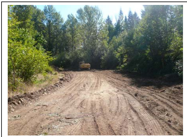
Implementation: Project begins with clearing of site and pond excavation: August 2007