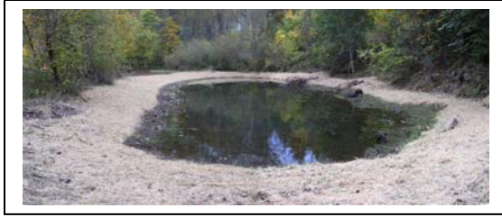
Post Implementation: Slopes are stabilized with native planting of Elymus Glaucus. October 2007