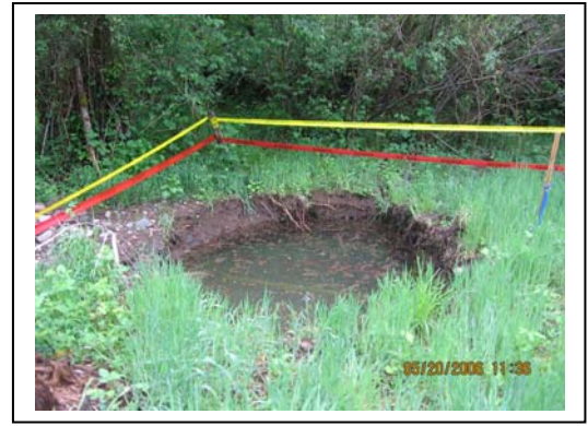
Pre-Implementation: West hole; indicates consistent water levels over time. May 2006