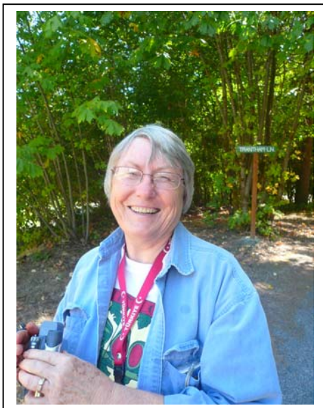
Implementation: Satisfied landowner.