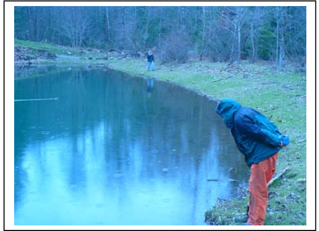
Post-Implementation: Aquatic vegetation plugs examined for establishment. March 2008